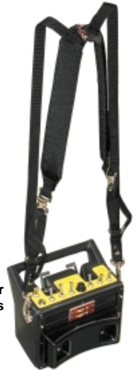
Mid-size Transmitter with Harness

Five sizes are available, including a compact transmitter designed primarily for locomotive control (please see back page for more complete descriptions). Choice depends on control functions and portability required for the application. The portable, lightweight transmitters are easier to operate than manual controls.