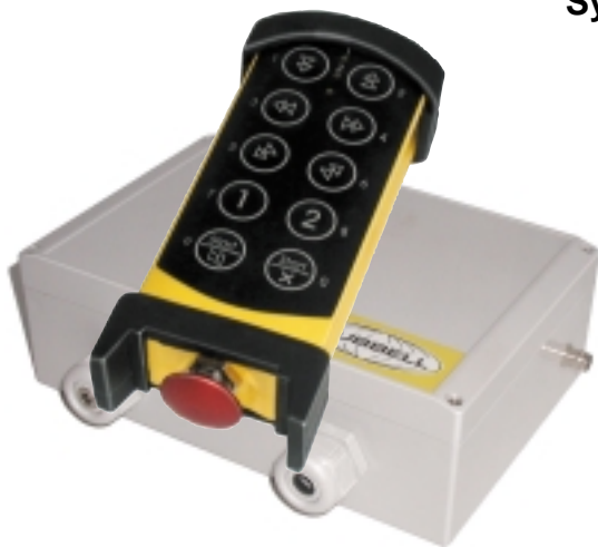
License Free Transmitter and Receiver